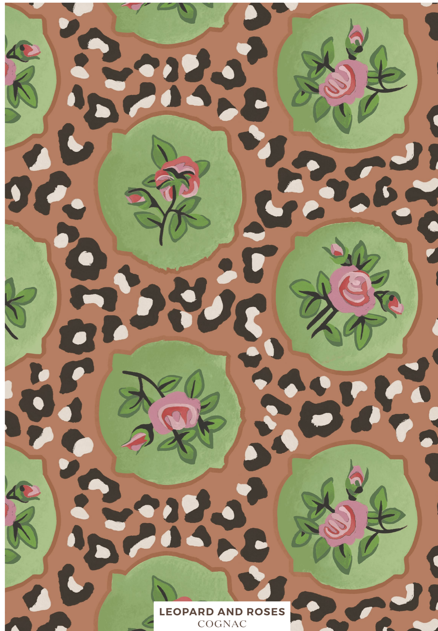
LEOPARD AND ROSES COGNAC