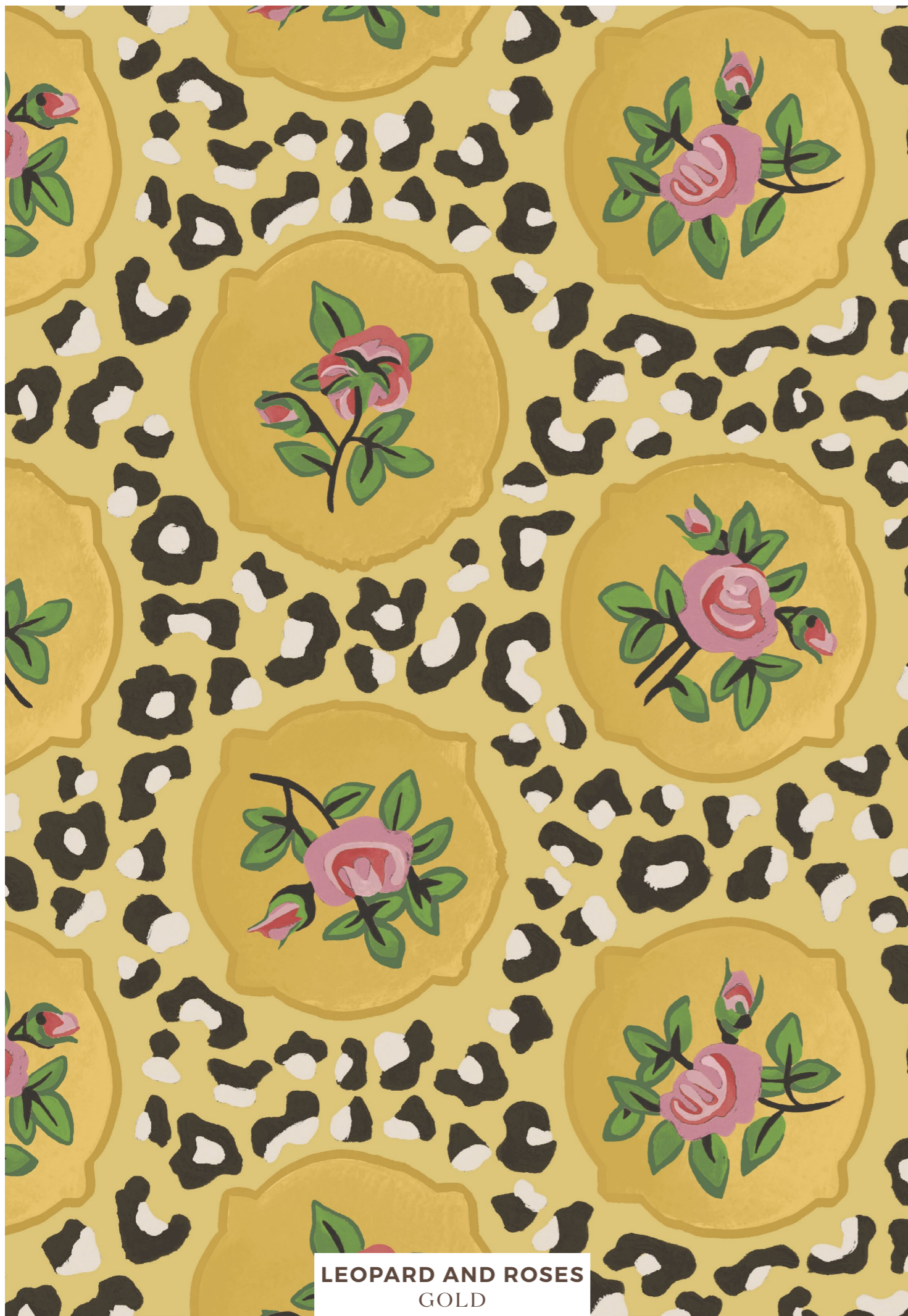
LEOPARD AND ROSES GOLD