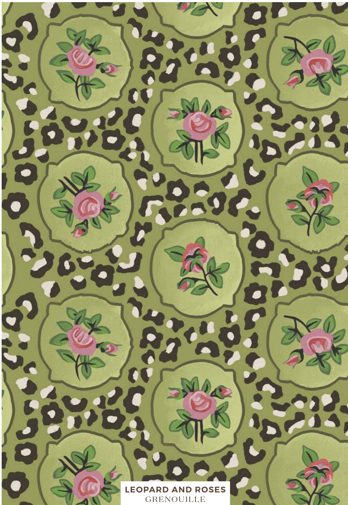
LEOPARD AND ROSES GRENOUILLE