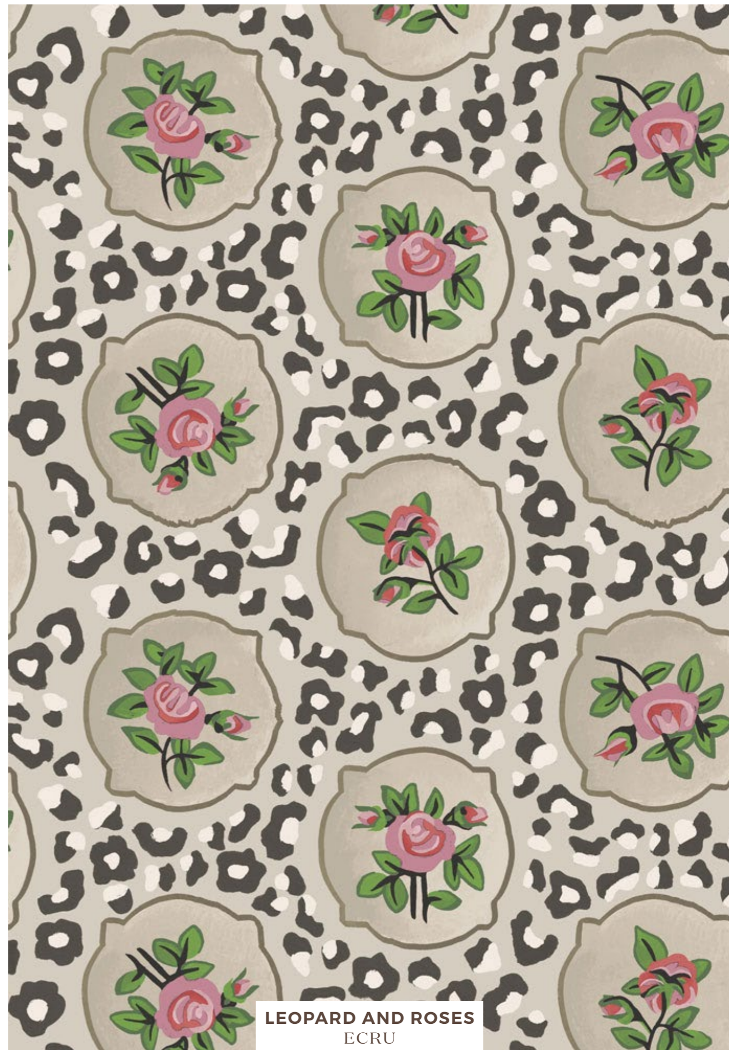
LEOPARD AND ROSES ECRÚ