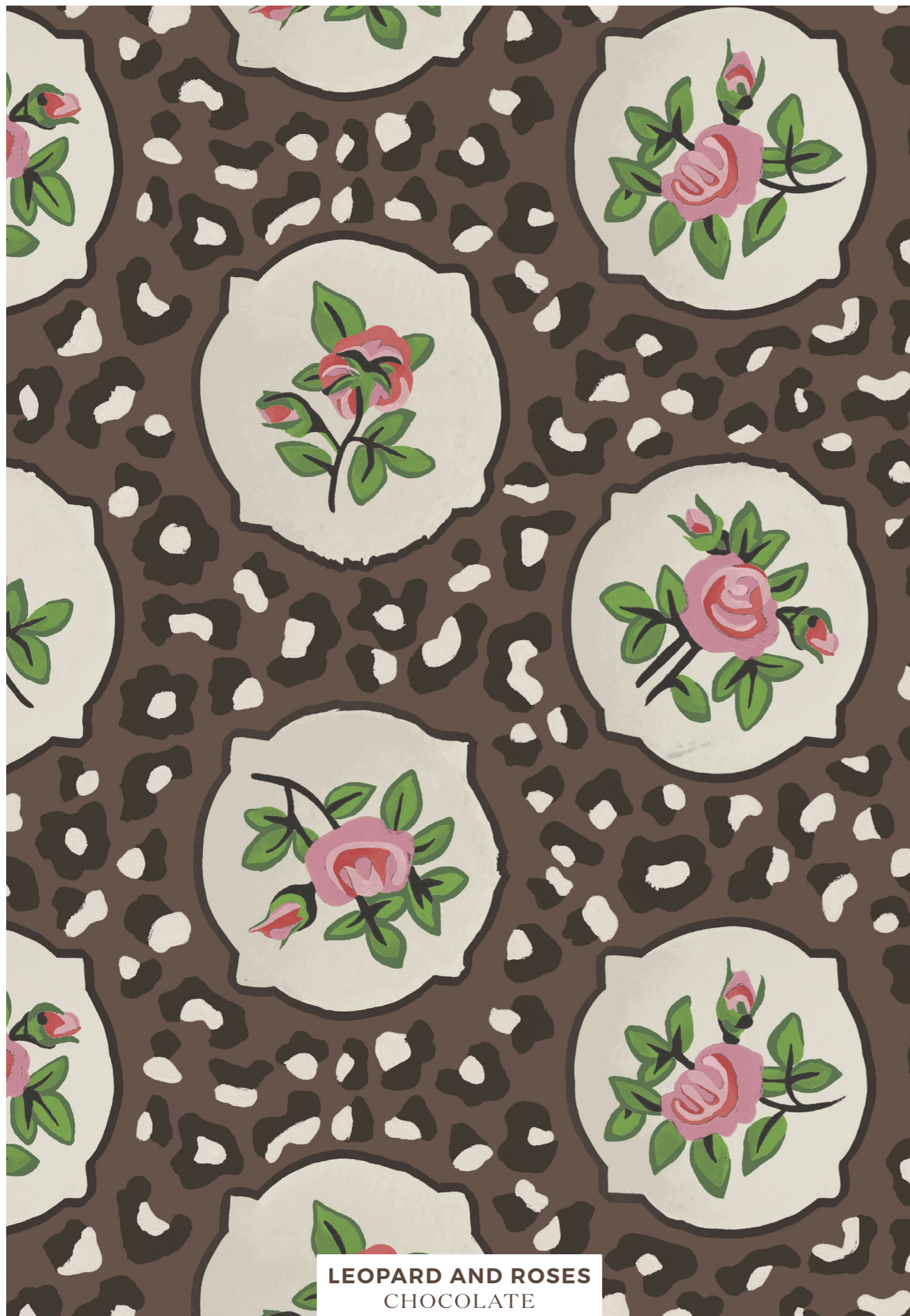
LEOPARD AND ROSES CHOCOLATE