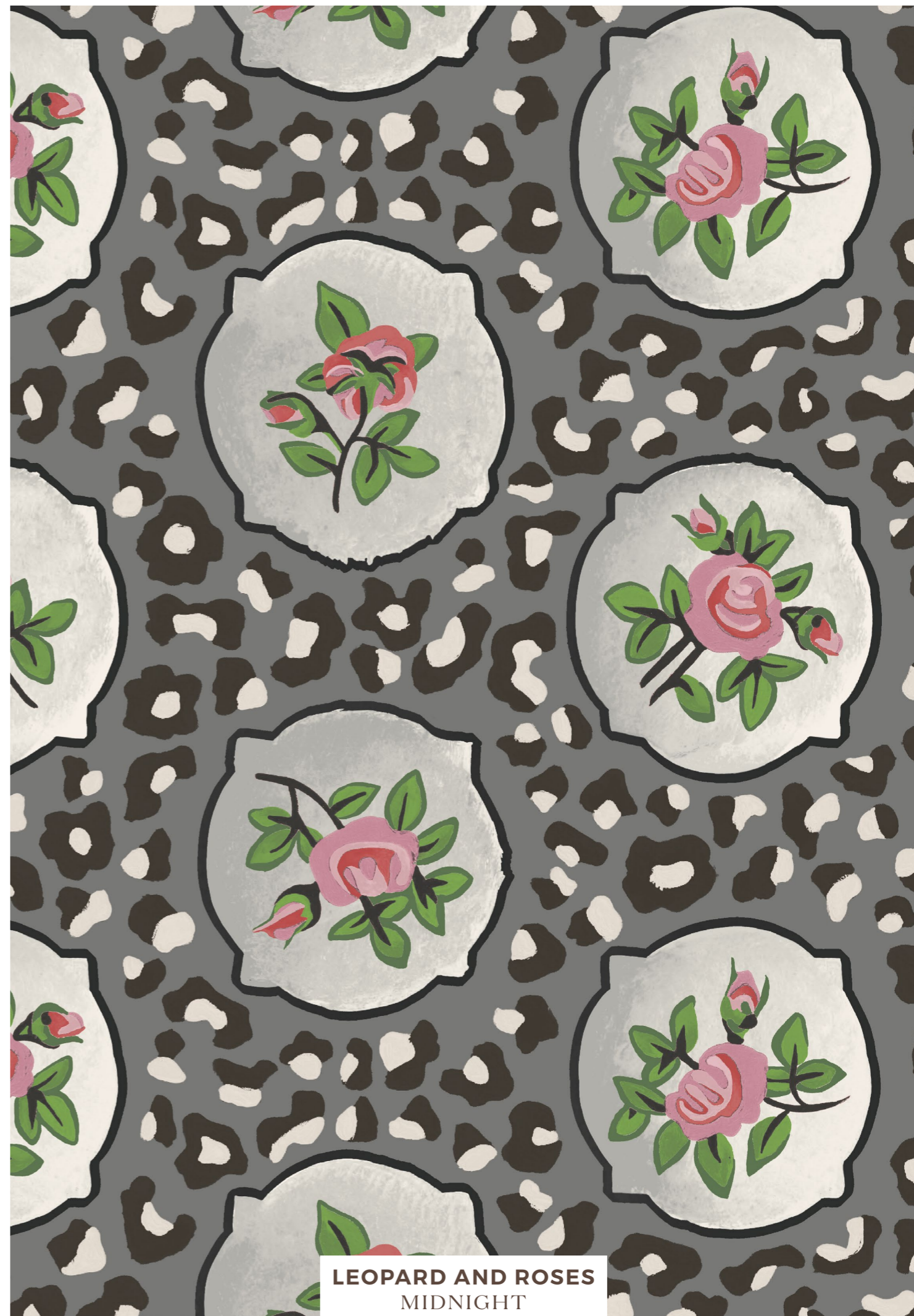
LEOPARD AND ROSES MIDNIGHT